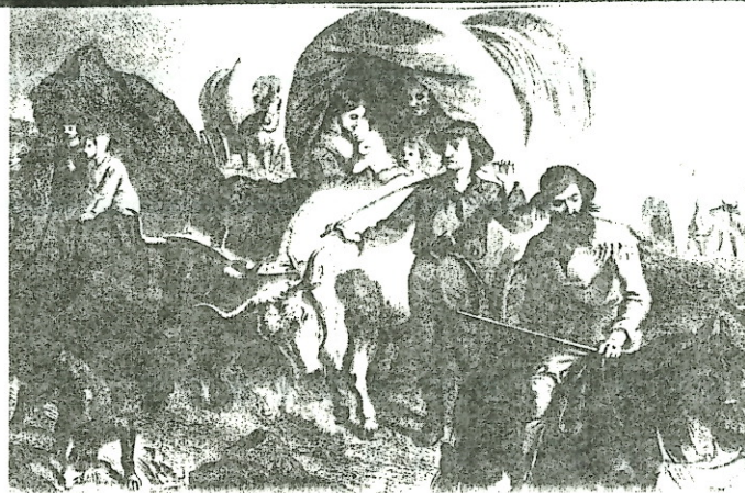
"Emigrants Crossing the Plains" by Felix Darley (1869)